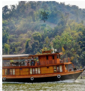
Sunset River Cruise